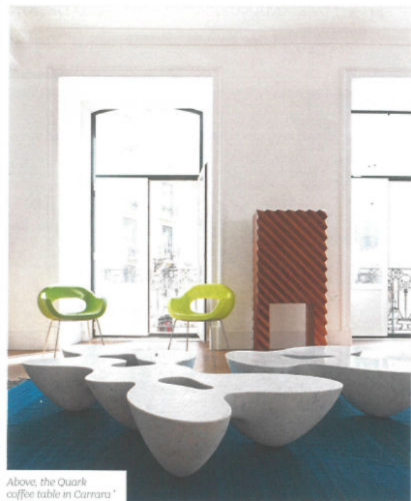
Above, the Quark coffee table in Carrara* marble (2009). In the background, the Arcana Wood credenza (2015). Upper right, in another space: Omega vase by Venini 2014, Shake chandelier, 2010.

wood floors. I improved the place, especially in terms of the overall physical plant and the service zone. It was ideal for a creative hub, a place of energy and concentration, surrounded by my objects. A few months later we began to work on the other level, the third floor, divided into rooms decorated with the typical blue azulejos this is a place in which to formulate the concept of a creative hub that encourages fluid, circular communication of ideas, in a rigorous layout of six independent offices combined with the gathering places of large shared areas. The result is a place for co-working, research and initiatives related to the crafts industry. I call it "The Third Floor" and I have intentionally left it almost empty (with the exception of some essential furnishings supplied by Magis), for easy reconfiguration to meet the needs of temporary events. An island with large tables we have designed for every room, ceiling fans and wallwasher lighting fixtures, spaces that communicate with each other thanks to large doors."